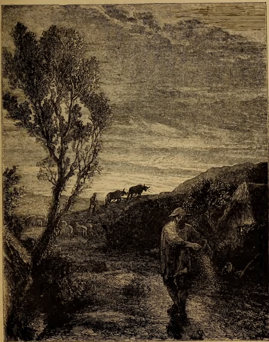
SOWING AND REAPING.